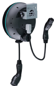
Braking system for cable