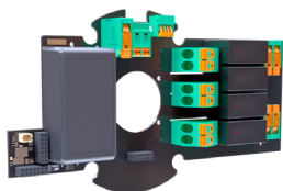
Electronic cable management system