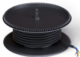
High flexible cable optimized for CReel