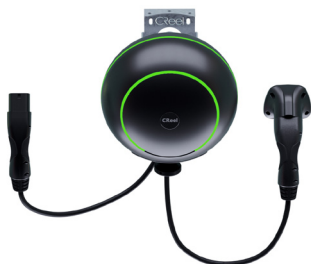
Led function for charging status